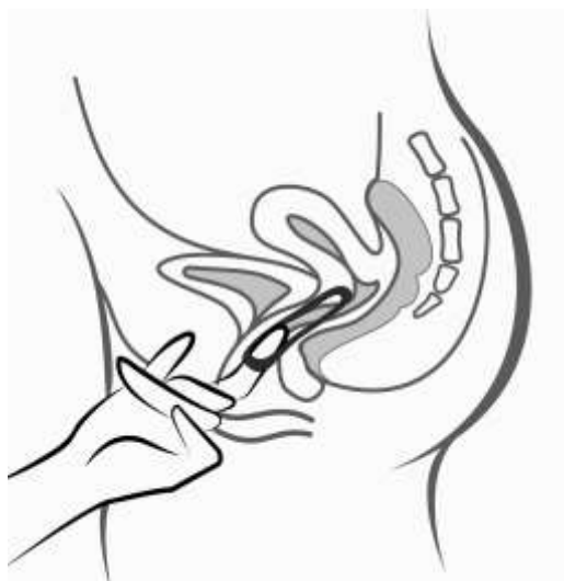
Figure 5: Nillho can be removed by hooking the index finger under the ring or by grasping the ring between the index and middle finger and pulling it out.