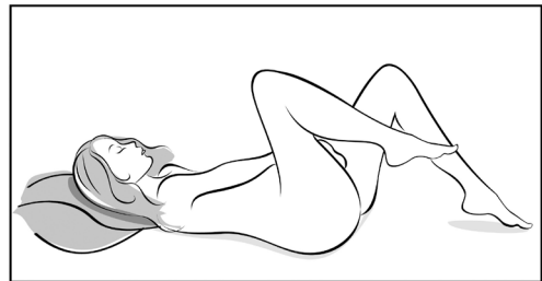
Figure 3 Choose a comfortable position to insert the ring