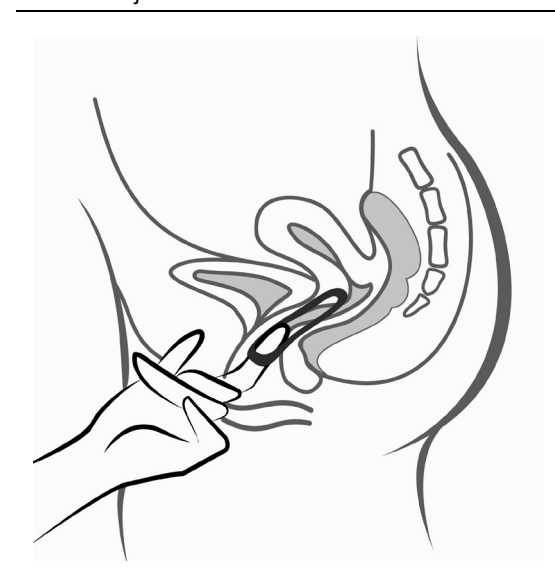
Figure 5: [nationally completed name] can be removed by hooking the index finger under the ring or by grasping the ring between the index and middle finger and pulling it out.