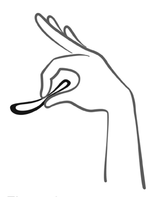
Figure 2 Compress the ring