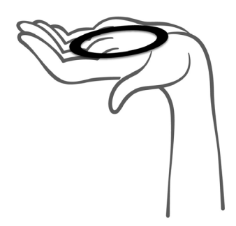
Figure 1 Take [nationally completed name] out of the sachet