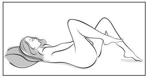
Figure 3 Choose a comfortable position to insert the ring